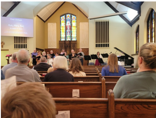
Easter Sunday Pictures. We had two beautiful, meaningful services on Easter Sunday.