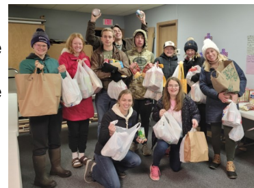
Confirmation Students with Thanksgiving Basket supplies.