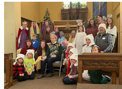
No Rehearsal Christmas Program