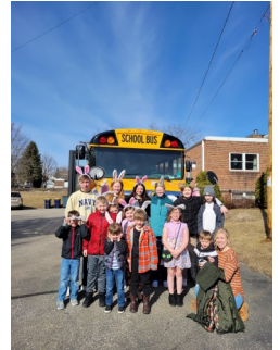
Sunday School students delivering Easter Baskets to shut ins.