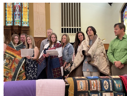
Graduate Quilt Sunday