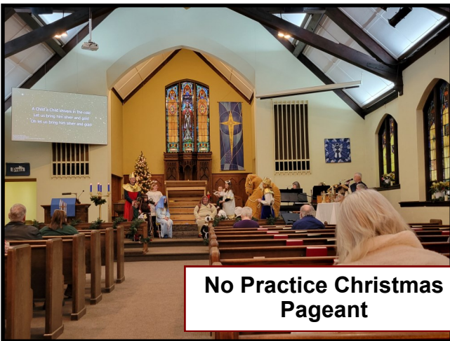
No Practice Christmas Pageant