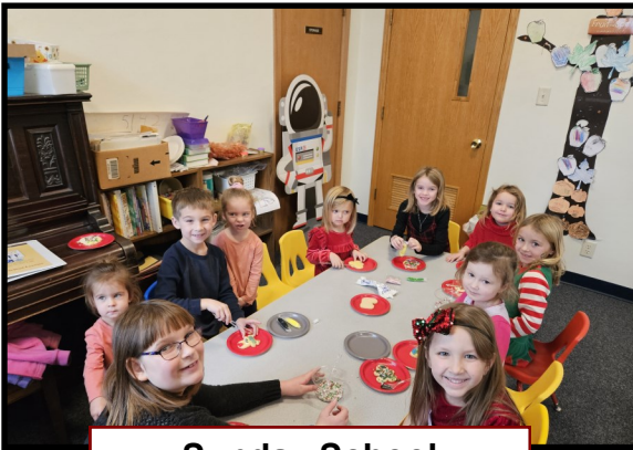
Sunday School Christmas Party

Our Vision: A Christ-centered, serving community.