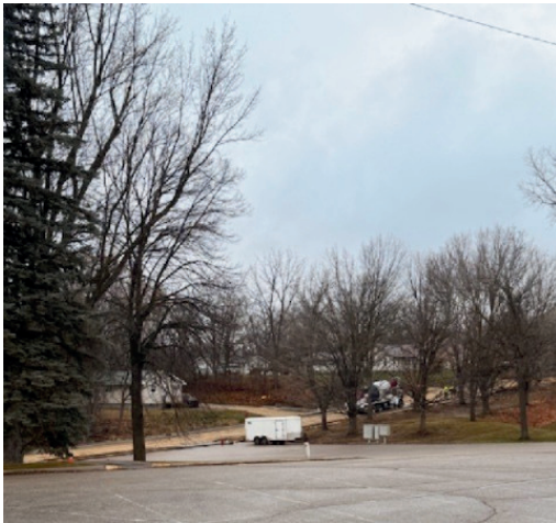
Construction: Nearing completion (we hope). Next spring they plan to be working further south on Piety.

Happy Holiday Season We wish you a joyous Christmas! Celebrate the Reason for the Season!