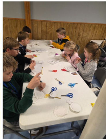
Kingdom Kids in December