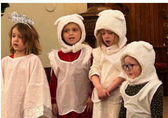
Christmas Pageant December 14, 2025