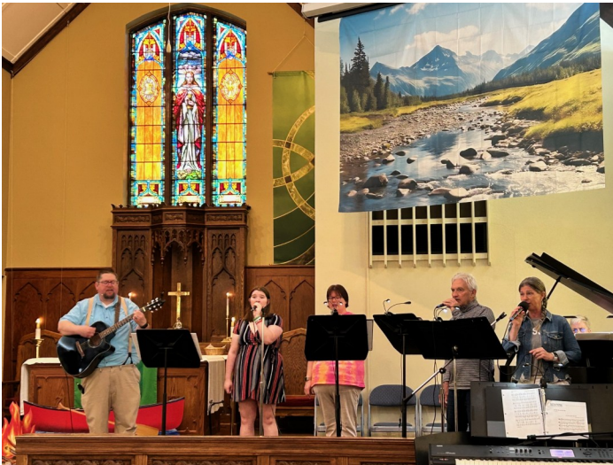
Bible Camp Worship -June 15, 2025

Our Vision: A Christ-centered, serving community.