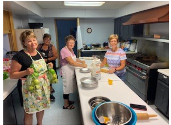
Baking pies at the church. The church was filled with the smell of baking pies.

We are also looking for volunteers. Join us if you can.