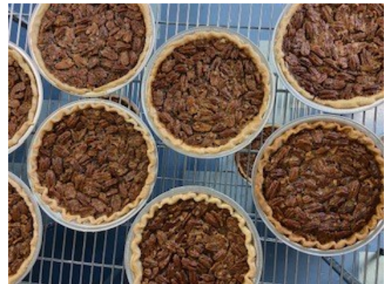
Pie Baking at the church on Monday, July 22 was a great success and a lot of fun!