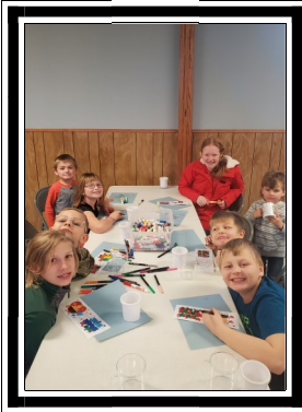
Sunday School Christmas Party