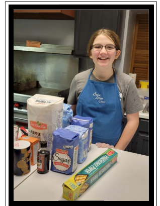
Piper's Bake Sale