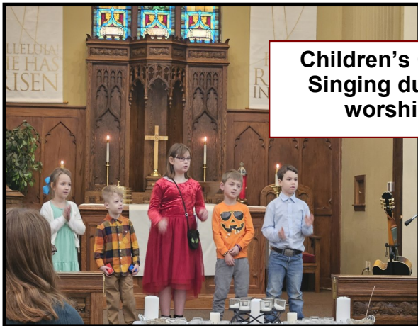
Children's Choir Singing during worship

Our Vision: A Christ-centered, serving community.