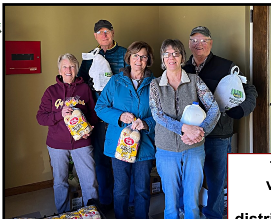
Turkey Basket volunteers who assembled & distributed the baskets!