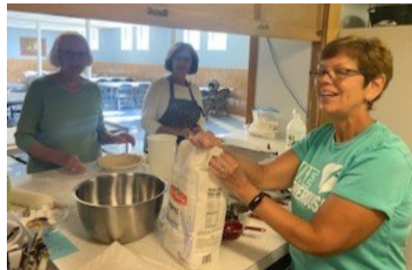
Delicious Pies - getting ready for the Pierce County Fair! Thank you to all the volunteers that help with this initiative!!