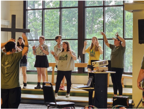
Piper at Luther Point Bible Camp

Our Vision: A Christ-centered, serving community.