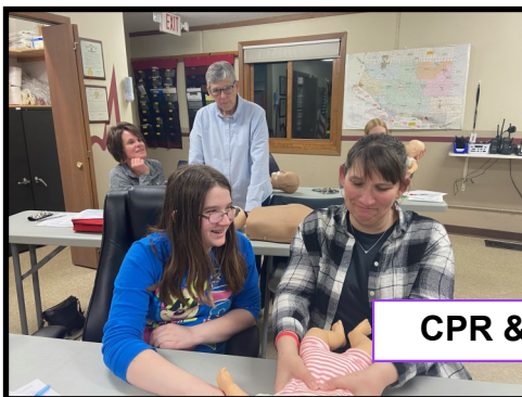
CPR & AED Class