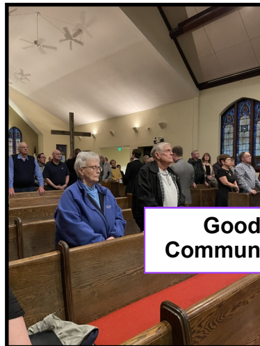
Good Friday Community Service