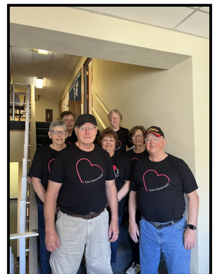
Sharing & Caring Hands Volunteers